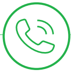
Automated, unsolicited calls and voicemails