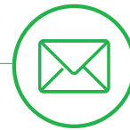
Letters sent to associates