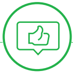
Facebook and Twitter ads