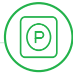
Waiting in parking lots